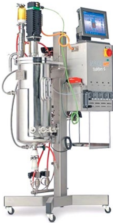
Bioreactor Techfors-S

Another important variable is the pH value. For microbial bioprocesses this is done with the addition of liquid acids and alkalis. For cell culture, on the other hand, one uses only liquid alkalis. The liquid acid can damage the cells so you use CO 2 instead of liquid acid.